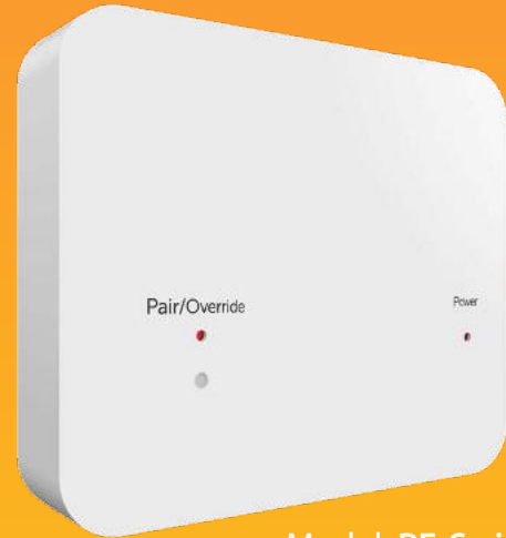
Model: RF-Switch 16A